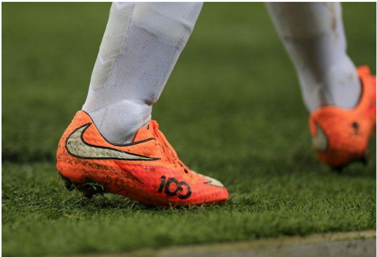
The Nike boots of England's Wayne Rooney commemorating his 100th cap

Nike, Inc. is an American multinational corporation that is engaged in the design, development, manufacturing and worldwide marketing and selling of footwear, apparel, equipment, accessories and services. The company currently has kit deals with both Manchester United and Manchester City, England and many other sports outfits across the world.