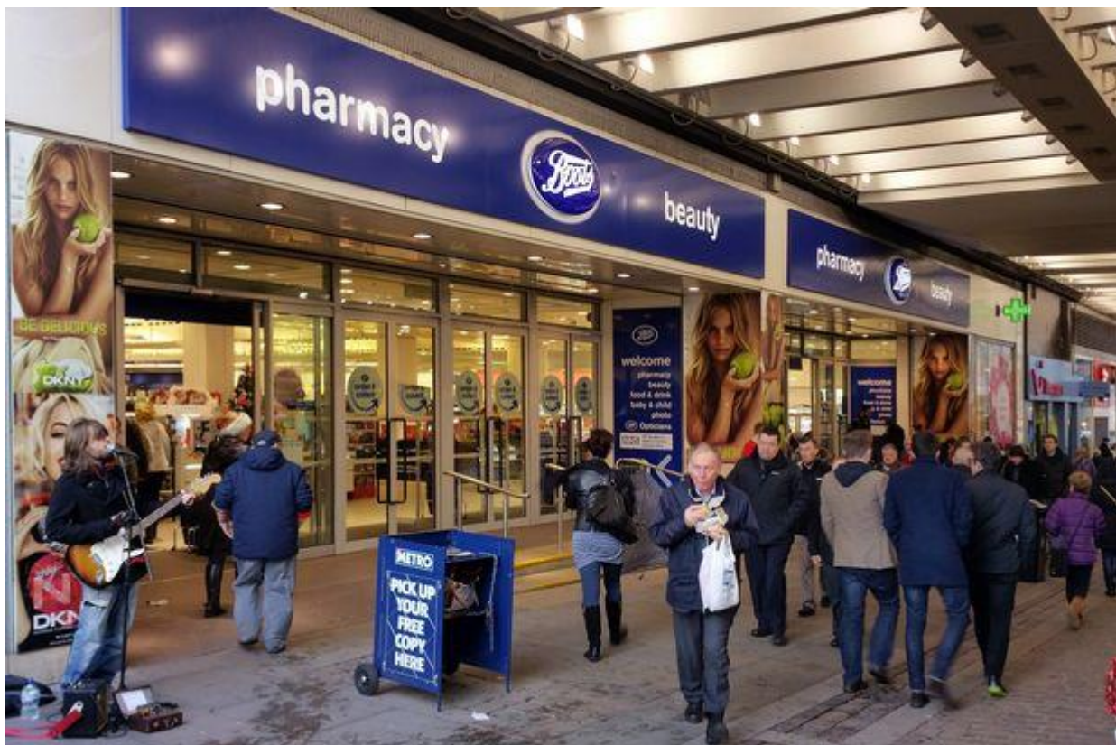
Boots on Market Street, Manchester